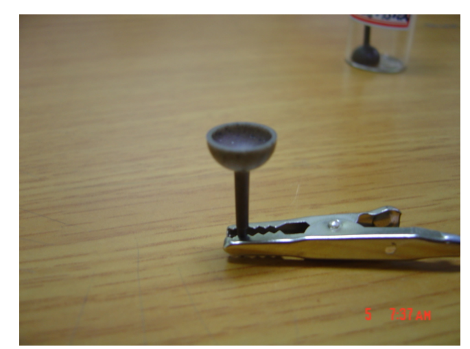
Fig. 3. A photo of a contaminated arc-tube

The powder was extremely sensitive to contamination. Contamination sources existed in the molding, debinding and sintering. In the molding, highly abrasive hard particles of the alumina could scratch the surface of the tooling to contain metallic contaminants in the product. In the debinding process, carbon residue in the brown body might leave carbon contaminants in the product. In the sintering process, any contaminants from the tube of the wet hydrogen supplying device or the wall of the furnace might degrade the translucence of the arc-tube. Fig. 3 shows a photo of the contaminated arc-tube. Contamination sources were investigated by EPMA. The debinding and sintering condition should be delicately chosen for the minimum contamination level and geometrical stability of the product. The optical transmittance of the final product was tested and showed satisfactory result as shown in Fig. 4.