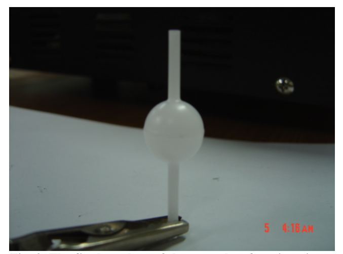
Fig. 2. The final product of the arc-tube after sintering

The two molded halves were bonded at the center before debinding process in a solvent. A proprietary bonding technique at room temperature was developed in the study. The bonded green body of the arc-tube was debinded in a solvent and in a furnace in order to burn out the binder completely. The brown body was completely sintered at 1800^{\circ} C in a high temperature furnace. Fig. 2 shows the sintered arc-tube.