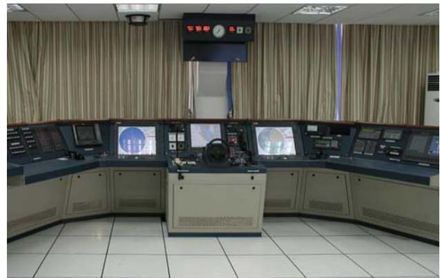
Figure 1. IBS simulator in Shanghai Maritime University

These standards are mainly proposed for maritime education and training. There are still two gaps need to be filled. (1) Lack of standards for research and advisory applications such as harbor and water way design, law suit application etc. (2) Needs of consideration of the innovation of bridge systems, since Integrated Bridge Systems (IBS) are increasingly popular on board modern ships, and new equipments, such as automatic identification systems (AIS), voyage data recorders (VDR), global maritime distress and safety systems (GMDSS), etc., become mandatory in ship bridges. Shanghai Maritime University has successfully developed an IBS simulator based on a real bridge system (Figure 1). IMO has also developed a model course, Operational Use of Integrated Bridge Systems Including Integrated Navigation Systems [12], for IBS training. It has been recognized that the safe and efficient use of integrated bridge systems and integrated navigation systems (INS) requires a level of knowledge beyond that normally given in the training of an officer in charge of a navigational watch. It is not just a matter