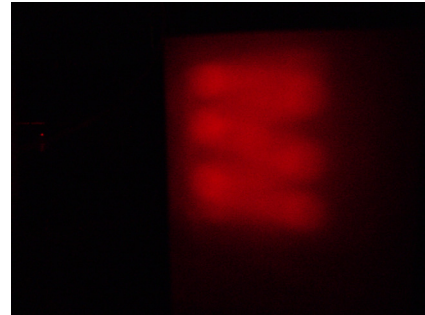
Fig. 2. (a) The conical lensed tip of HPCF with radius of 15 \mu\text{m} . (b) The ball lens made of silica with radius of 250 \mu\text{m} . Fig. 3. A typical Lissajous pattern of LED collimated beam which has been made by the 2D micro mirror.

The optical fiber used in this experiment is a hard polymer optical fiber (HPCF) with a 200 \mu\text{m} pure silica core and 15 \mu\text{m} thick low index polymer cladding. Typical NA ranges from 0.37 to 0.48. A dome shaped red LED with Luminous intensity of 4500 mcd and total flux of 1.2 cd/lm chosen for the light source. The dominant frequency of 630 nm observed at 2.5 volt applied voltage. The LED coupled to HPCF by an objective lens acting as a telescope system with reduction of 20 times. Figure 2 shows the proposed micro collimator on the output tip of the fiber. It includes of a silicon ball lens with radius of 250 \mu\text{m} and a conical lensed tip of HPCF with an approximated radius of 15 \mu\text{m} . Both the conical lens and the ball lens fabricated through arc discharger of a splicer device. The coupling loss in the coupling area, between the collimator and the fiber, seriously depends on misalignment of the ball lens and the tip of the fiber. The coupling loss for the HPCF is 3 dbm. The spot size at 40 mm from the mirror is roughly 6 mm. this working distance in comparison with the working distance of other recent collimators is an excellent value [3]. Figure 3 shows a typical Lissajous pattern of LED collimated beam which has been made by the 2D micro mirror.