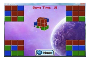
Fig. 5. 3D visual sense training game

This is a constantly rotating cube, Cube formed by the three colors. You need to find the correct projection that the arrow point to the projection. In the four projection, you only one chance to select the correct answer. Every times, the game will randomly generated the cube.