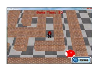
Fig. 3. Logical training game

In a certain period of time, User need to find the mushroom at the end of maze to win the game. Every times, the game will randomly generated maze.