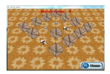
Fig. 2. Memory training game

Beginning of the game, user has 5 seconds to remember the location of animals. 5 seconds later, all animals would be hidden in a wooden box. User need to find all of the same animals in order to pass the game. Every times, the game will randomly generate the location of animals.