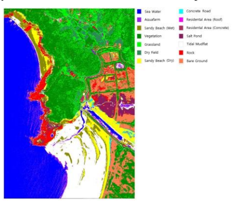
Figure 2. The results of SAM classification

Fig. 2 shows the result of landcover classification conducted with the images after atmospheric correction. In the case of SAM classification using atmospheric-uncorrected images, a considerable portion of tidal mudflat was misclassified as rocky terrain. Also a boundary between land and sea appeared unclearly but the boundary became clear and misclassification of a sandy beach area was corrected. after atmospheric correction.