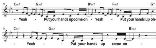
< Score 3. intro of 'Already Alright' >

(3) Type of Ad-Libs which is using 5 tones as scale