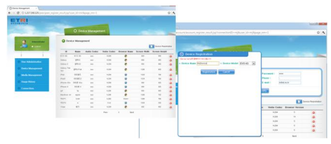
Figure 2. Compatibility search application

After running the compatibility search application, the web contents(web pages, video files, images) transferred by connected screen devices are combined to provide new multi-screen application service. Based on the properties of screen devices and browser information, this is to make users transfer chosen web contents from one screen to another, increasingly expecting their screens to integrate into a consistent experience across all platforms.