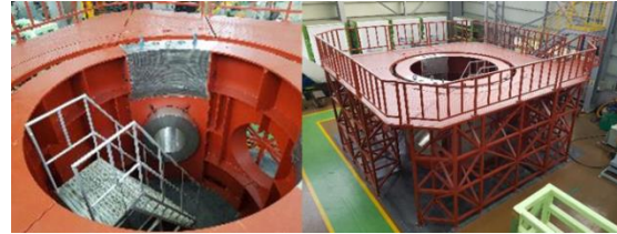
Fig. 5. RV Mockup Installation.

segmentation scenarios, a mockup was made and installed in a field. And auxiliary structure was installed for industrial safety.