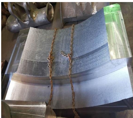
Fig. 4. Specimen of RV Flange.