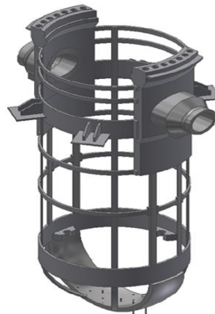
Fig. 2. Concept Image of the RV Mockup.

The RV mockup should be the same size of actual RV in the form of a circular cylinder. However, since the structure is circular and symmetrical, it is not necessary to manufacture all of them. As shown in Fig. 2, the actual mockup is partially manufactured.