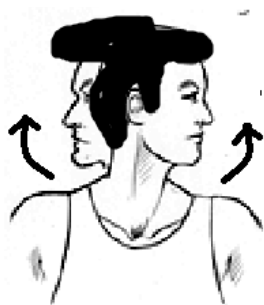
Fig. 2. Rotation