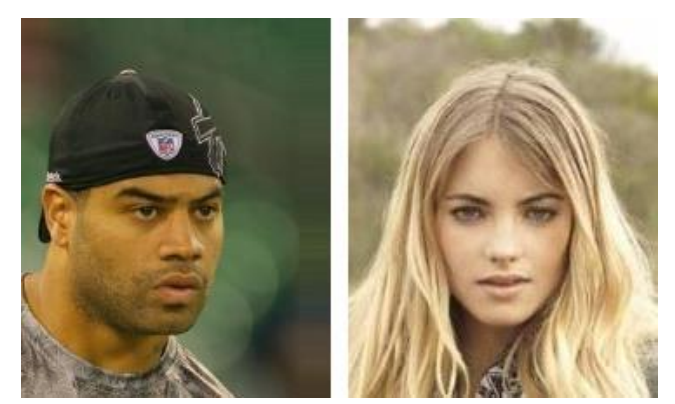
Figure 1. Each image contains a 40 binary labels, which leads to multi-label tasks. For example, the left image positive attributes are big lips, big nose, chubby, male, wearing hat, young, and the right are attractive, blond hair, heavy makeup, young.

The study in [7] implies that the labels of the face image are necessary for controlling the output image, leads to the increasing of diversity, and extends the implementation field of GANs. CelebFaces Attributes (CelebA) [8] is a large-scale face attributes dataset with more than 200K celebrity images,