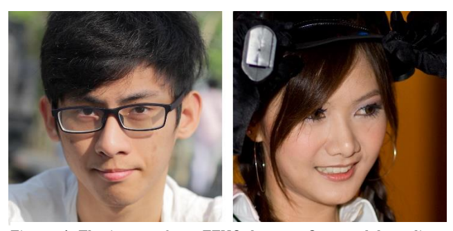
Figure 4. The images from FFHQ dataset. Our model predicts the left image with the positive attributes are male, no beard, young, and the positive attributes of the right positive attributes are attractive, bangs, heavy makeup, high cheek bones, mouth slightly open, no beard, pointy nose, smiling, wearing lip stick and young.

get the lowest AUROC attribute is Pale skin (<40), the mean AUROC of all classes is 0.7611.