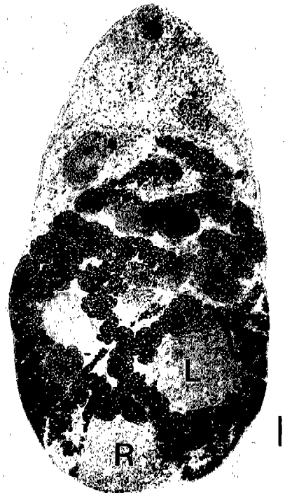
Fig. 3. Metagonimus takahashii collected from Park OO (54/M) in Table 1. No posteriormost location of right testis (R), separated left testis (L) from the right one, distribution of uterine tubule over the left testis and intertesticular junction, vitellaria passing through the posteriormost portion of the body. Unstained. Bar = 100 \mu\text{m} .