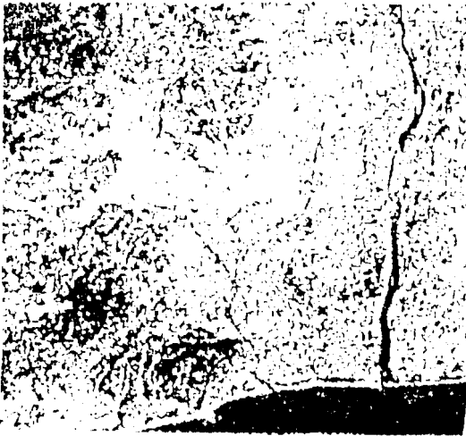
Fig 3. Result by Maximum percentage Method