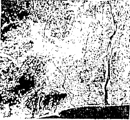
Fig 2. Result by Maximum Number Method