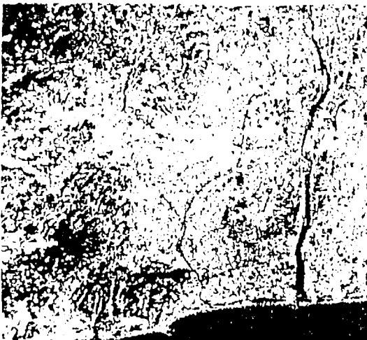
Fig 4. Result by Minimum Distance Method

sult (Fig. 6) by a human operator. In other words, a good result was obtained with roughly selected TCA.