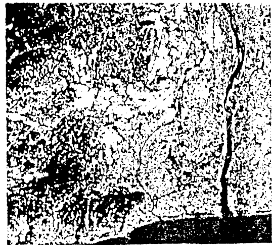
Fig 6. Result by Supervised Method