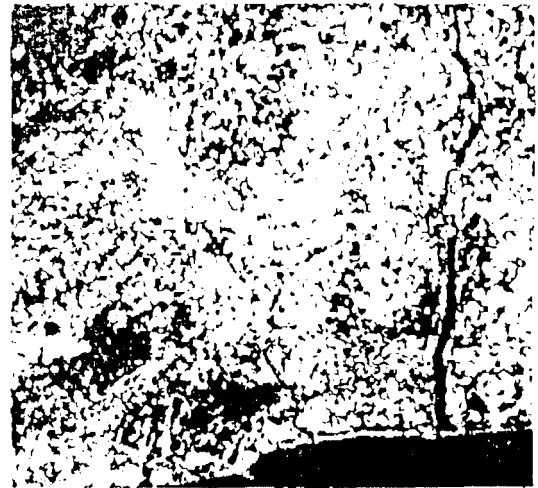
Fig 5. Result by Element Ratio Matching

For the purpose of comparison, conventional supervised method was executed. In this method, clusters were categorized by a human operator. 66 clusters were labeled with 14 categories (Table 1) as shown in