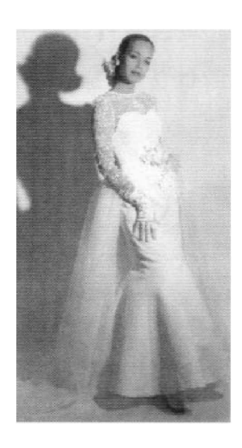
< Fig. 3> Mermaid silhouettes (My Wedding, Jan., 1997)

houette with 27%. For tubular shape the distribution was 6.5% and 6% for A-line, And the distribution was 3.5% and 0.8% for mermaid shape and balloon shape respectively. Therefore it can be said that the dome shape is the most widely used silhouette for wedding dresses in the late 1990's. The reason the exaggerate dome shape is popular seems to be influenced by romantic tendency, that is one of the general fashion styles. In late 1990', that is to say, the romanticism suggested by the prominent designers around the world and the princess syndrome in Korea set the romantic tendency in wedding dress<sup>19</sup>. Therefore the exaggerate balloon dome shape in wedding dress silhouette came to be popular.