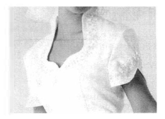
<Fig. 8> Sweet-heart neckline (My Wedding, Oct., 1997)