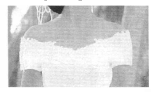
<Fig. 10> Off-shoulder neckline (My Wedding, Aug., 1997)

of the past. Although their distribution is insignificantly small, there were off-shoulder necklines (Fig. 10), camisole necklines, the strapless neckline, and other necklines with a lot of exposure such as the oblique neckline, the halter neckline, and the bared top neckline. Although wedding dresses with these