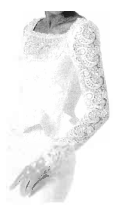
<Fig. 12> Long tight set-in sleeve (My Wedding, Nov., 1997)