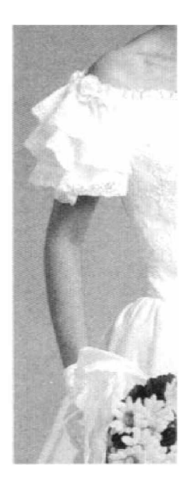
Fig. 14> Tiered sleeve, a kind of short or layered dropped sleeve(My Wedding, July, 1997)