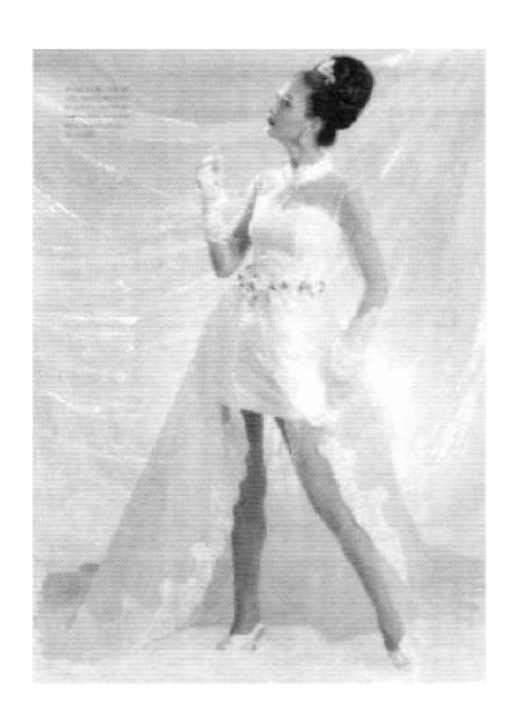
<Fig. 5> A dress with skirt of mini length by attaching a train (My Wedding, Feb., 1998)