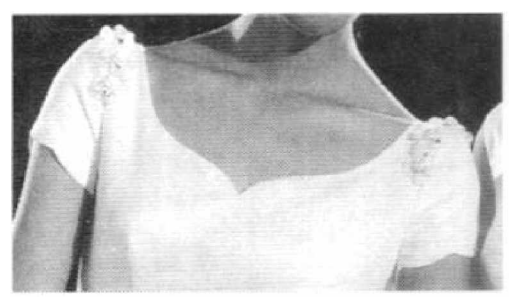
<Fig. 7> Heart-shaped neckline (My Wedding, Oct., 1997)

shown in (Table 2), without collars but were characterized instead by various different kinds of necklines. The most common neckline was the square neckline with 14.0%, and the high neckline was next with 13.0%, 9.9% had off-shoulder necklines, 8.9% had low necklines, 8.2% had heart-shaped necklines(Fig. 7), and there was 7.7% each of sweet-heart necklines (Fig. 8) and boat necklines. The round neckline had a 5,5% distribution, and the V-neckline had 5.3%, 5.1% of the dresses had necklines that were heart-shaped and off-shoulder at the same time. There were also necklines which are rarely applied to everyday garments such as the scalloped neckline(Fig. 9) and the key-hole neckline, The application of several necklines also showed that there was more exposure in wedding dresses of the recent years than those