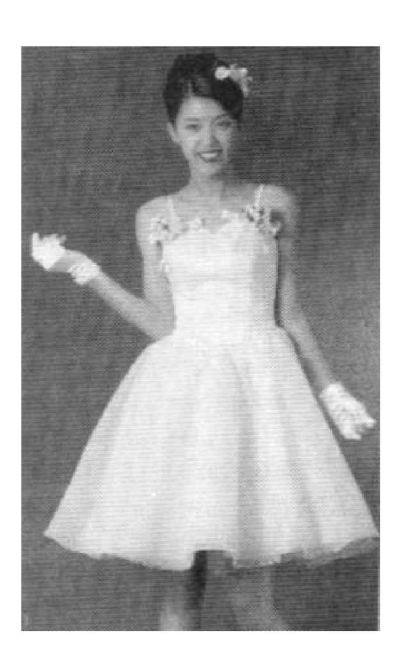
<Fig. 4> A dress with skirt of mini length (My Wedding, July, 1997)

In terms of the distribution in skirt length, the length with the hemline reaching the floor was the most common with 98.4% as can be seen in (Table 1), and 0.9% and 0.7% had knee-length and mini hemlines respectively. The wedding dress with a hemline shorter than the conventional one like the dress in (Fig. 4) are appropriate for brides that want a fresh and cute image, and are usually worn for outdoor photo shoots. For the wedding ceremony, the dress is decorated to look more elegant by attaching a veil or a train like the dress in (Fig. 5)<sup>20)</sup>.