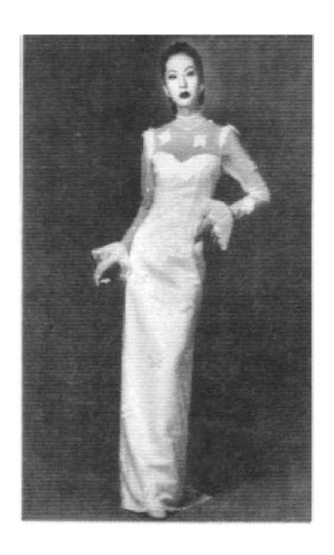
<Fig. 2> Tubular silhouettes (My Wedding, Nov., 1997)

one was the dome shape with 56% of wedding dresses having this silhouette. The bell shape was the next most commonly applied sil-