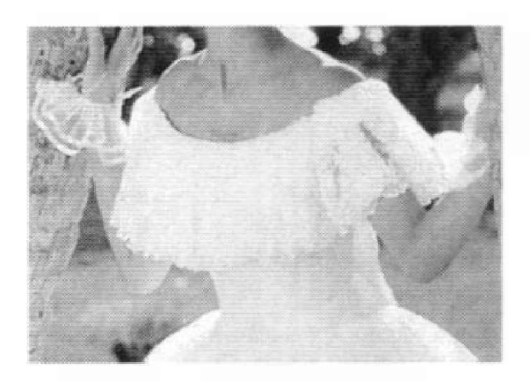
<Fig. 6> Bertha collar (My Wedding, Aug., 1997)

shown in (Table 2), without collars but were characterized instead by various different kinds of necklines. The most common neckline was the square neckline with 14.0%, and the high neckline was next with 13.0%, 9.9% had off-shoulder necklines, 8.9% had low necklines, 8.2% had heart-shaped necklines(Fig. 7), and there was 7.7% each of sweet-heart necklines (Fig. 8) and boat necklines. The round neckline had a 5,5% distribution, and the V-neckline had 5.3%, 5.1% of the dresses had necklines that were heart-shaped and off-shoulder at the same time. There were also necklines which are rarely applied to everyday garments such as the scalloped neckline(Fig. 9) and the key-hole neckline, The application of several necklines also showed that there was more exposure in wedding dresses of the recent years than those