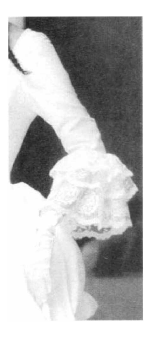
< Fig. 13> Below-elbow-length ruffled set-in sleeve (She's Bride, April, 1997)