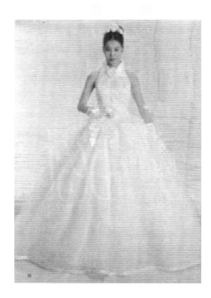
<Fig. 1> Dome silhouettes (She's Bride, July, 1997)

Among these silhouettes, the most common