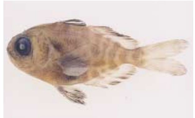
Fig. 2. Psenes maculatus Lütken, 46.7 mm in total length, collected from Tongyeong-si, Gyeongsangnam-do, Korea, lateral view.

Body compressed ellipse in shape with vertical bands ('<'shape) on trunk and tail in young stage. Head large with big eyes and small mouth. Scales very small. Lateral line high along sides following dorsal profile. Pelvic fins are large in young stage. This species has rows of melano-