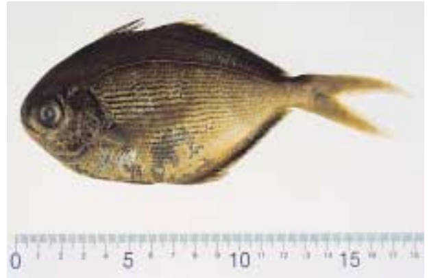
Fig. 3. Psenes cyanophrys Cuvier and Valenciennes, 179.0 mm in total length, collected from Tongyeong-si, Kyungsangnam-do, Korea, lateral view.

Psenes cyanophrys Cuvier and Valenciennes, 1833: 193~196, fig. 265 (New-Irlande)