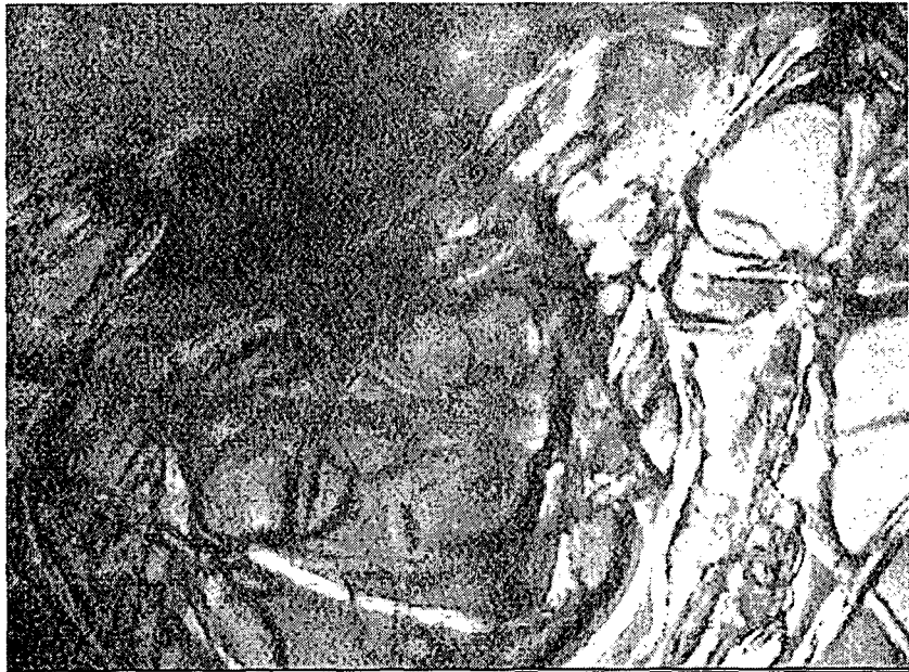
Fig.3 Entangled BongHan ducts inside atrium