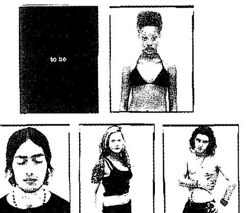
(Fig. 3) CK be Advertisement.- First part: To be.

In contrast, cK be is an eleven page serial advertising showing eight different models on