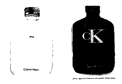
(Fig. 2) CK one and cK be Bottle.

For cK one, there are three different kinds of advertising format: one page, two pages, or four pages as a special inserted ad. Among them, the two page ad is seen most frequently, therefore, it was selected for this study (Fig. 1: cK one). This cK one ad shows many young people with