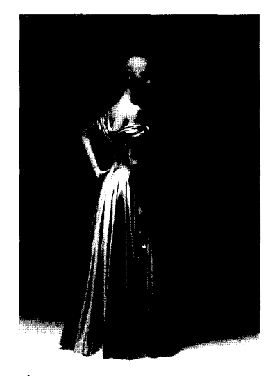
(Fig. 3) Evening gawn(1947). Jacques Fath ( Infra apparel , 58)

In the late 20th century, various fashions coexisted without a distinctive style or silhouette. Instead, clothes are presented to externally express a foundational motif itself. The theme of "the undergarment as an outer garment" by Westwood was sophisticated and sexy. Especially, the brassiere worn on the outer garment is presented at the 1982~3 Buffalo Girls collection and copied by many fashion designers and stylists. The corset in (Fig. 4) restored by Yve Saint Laurant in the 1990s was characterized by silk chiffon, black tulle, and velvet decoration, and reveals the features of the postmodern age welf.