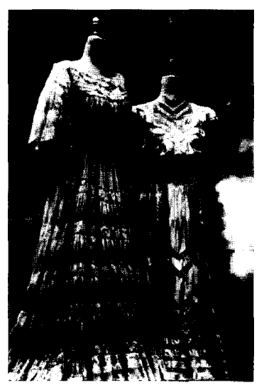
⟨Fig. 1⟩ L: Semi-evening dress(1903~4). R: Afternoon dress(1908). (Infra apparel, 84)

(Fig. 2) shows Madeleine Vionnet's honeycomb dress made of black silk organza in 1936. Vionnet used techniques for undergarment comprehensively. This honeycomb-shaped dress emphasizes the analytic structure hidden under the fabric, and skillful temperance and transforma-