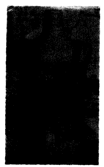
(Fig. 7) Corset(1920). (Underwear, 79)

panel only at the front to present a soft hip line and a flat stomach, and narrow band-type bras are in fashion to make the flat breasts.