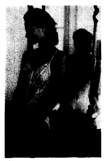
(Fig. 12) Bodyshaper(1940). (Underwear, 50)

the simplicity of underwear is expressed using stretchy lace and the tricot body shaper with various mode changes. The late 20th century brings about a great change in underwear material as a whole. Especially, it becomes possible, due to elastic fabric, to design undergarments with function and simplicity, and to emphasize the figure. The features of women's undergarments obtained from the study are as follows (Table 1).