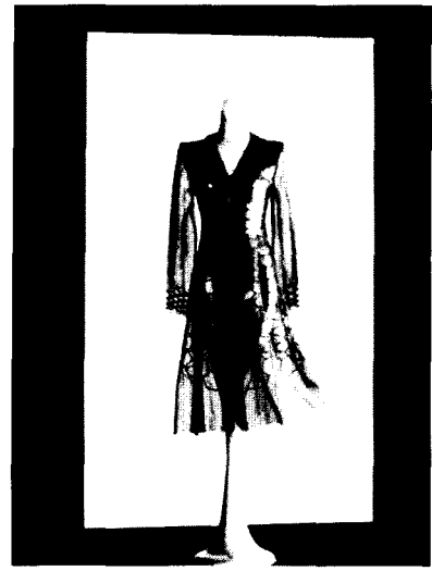
(Fig. 2) Honeycomb dress. Madeleine Vionnet, ( Infra apparel , 107)