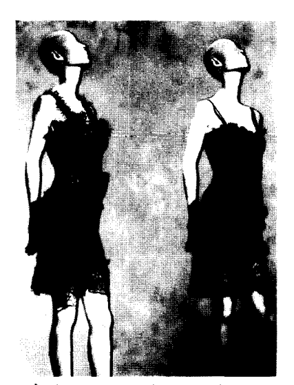
⟨Fig. 4⟩ Corset dress. '91~92 F/W (YSL, Infra apparel, 55)

As seen so far, the use of undergarment in late 20th century fashion shows systematic correlations with genderlogy, which was a costume-related conventional theme, physical and psychological pressures, and satisfaction. And