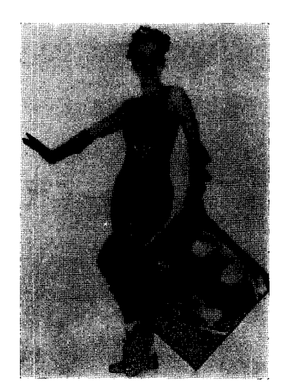
(Fig. 11) Bikini underwear(1990), (Underwear, 49)

In the 1990s softer styles prevail with a loose top and tight skirt or leggins worn. And underwear as shown in (Fig. 11), which suits any taste or situation, sells widely. In addition, women start to wear boxer shorts, body stockings, and special sports bra.<sup>24)</sup> As shown in (Fig. 12),