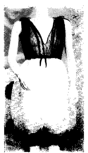
(Fig. 6) Caminickers(1900). (Underwear, 76)