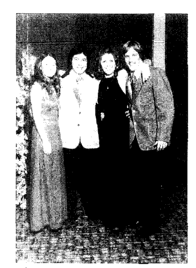
(Fig. 5) Long Dresses for Formal Occasion (1973).

students. Many women described their favorite styles as "simple" and "traditional". Of the fifteen respondents, the footwear most often referred to were sandals (eight), tennis shoes (seven), loafers (five), boots (four), pumps (four), high heels worn with more formal attire (four), clogs (three), shoes with platform soles