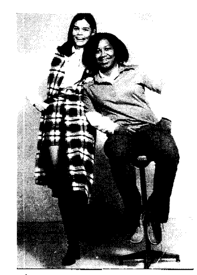
(Fig. 3) Hot Pants with a Midi Vest (1971).

when answering certain questions. For example, her ideal styles suggested a resistance to traditional feminine norms. It was often found that feminists presented their images as traditionally feminine on some occasions, which is consistent with the finding of Kunkel's study – – "Feminists negotiate the cultural ideals of femininity and a feminist consciousness in context-specific ways."<sup>26</sup>