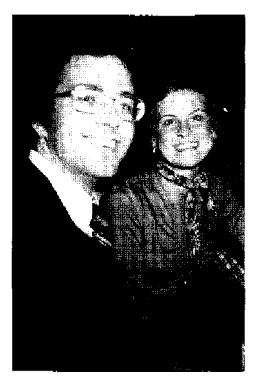
(Fig. 4) One-Piece Dress for Formal Occasion (1974).