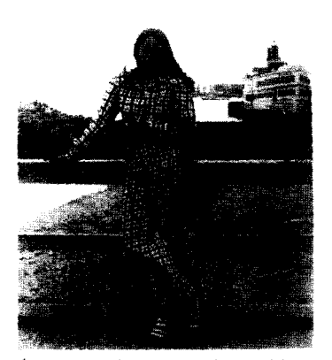
(Fig. 2) Pant Suits with Big Plaids (1973).