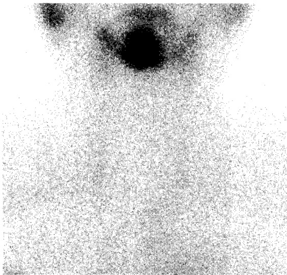
Fig. 1. A 31-year old woman was referred for thyroid scintigraphy to evaluate the protruding mass in tongue base. Tc-99m pertechnetate thyroid scan revealed focal intense tracer uptake in sublingual area, and no visible tracer uptake in thyroid bed, which is suggestive of the presence of ectopic lingual thyroid.

Key Words: Sublingual thyroid, Lactating breasts, Tc-99m pertechnetate thyroid scintigraphy