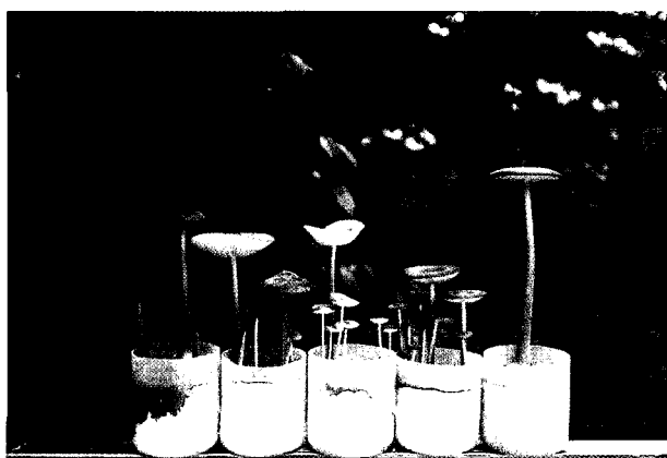
Fig. 2. The fruiting bodies of Oudemansiella radicata on sawdust media of Q. variabilis mixed with 10% rice bran.

Although fruiting bodies of 9 strains have been produced widely on oak sawdust media mixed with rice bran of 5 to 30%, the contamination of oak sawdust media