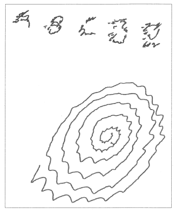
그림 2. 진전증 환자의 쓰기 및 그리기

involuntary trembling in part of the body; most often seen in the hands and head and also may affect the arms, voice (larynx), trunk, and legs.