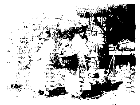
(Fig. 3) Children Costumes.<sup>6)</sup>

is little about children's costumes, which makes it difficult to research into them. Even this study could not convincingly review common children's costumes, because the data collected for this study were almost about Yangban children's one. The longitudinal life paintings referred to by this study are folding screen paintings as