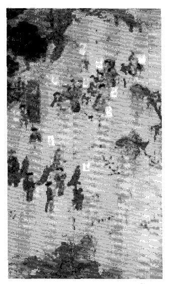
(Fig. 2) Birthday Party.<sup>5)</sup>

is little about children's costumes, which makes it difficult to research into them. Even this study could not convincingly review common children's costumes, because the data collected for this study were almost about Yangban children's one. The longitudinal life paintings referred to by this study are folding screen paintings as