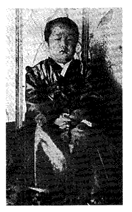
(Fig. 5) Children Costumes.<sup>91</sup>

What our ancestors wished and desired most were wealth and safety in this world, prosperity of offsprings and longevity, which were supported by the realistic Confucian life philosophy during Chosun dynasty to encourage more realistic patterns. Thus, colors were more diversified than creative. Such a trend was more conspicuous for children's costumes. A baby is born to be an independent life growing through several stages. He would be protected by parents until he was celebrated for coming of age, while parents poured their hearts to pray for their children's