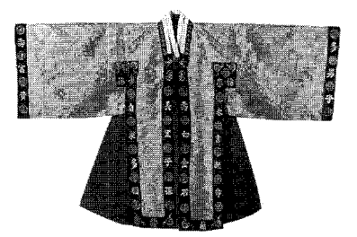
(Fig. 6) Children Costumes.<sup>10)</sup>