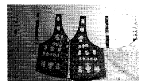
(Fig. 4) Children Costumes (Cheju Island).<sup>7</sup>

adults' trousers. Baeja with no sleeves consisted of back and front, and back was longer than front.