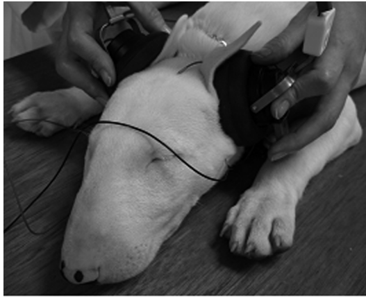
Fig 1. A white Bull Terrier puppy undergoing a BAER test; three electrodes are placed under the skin and the headphone was held against the pinna, so that the click sound would be directed down the external ear canal, the electrical response of the brain is then recorded.

To assess the apparent deafness, the BAER was recorded and analyzed. To validate the test, the BAER was also assessed on a normal littermate. Because the BAER test is