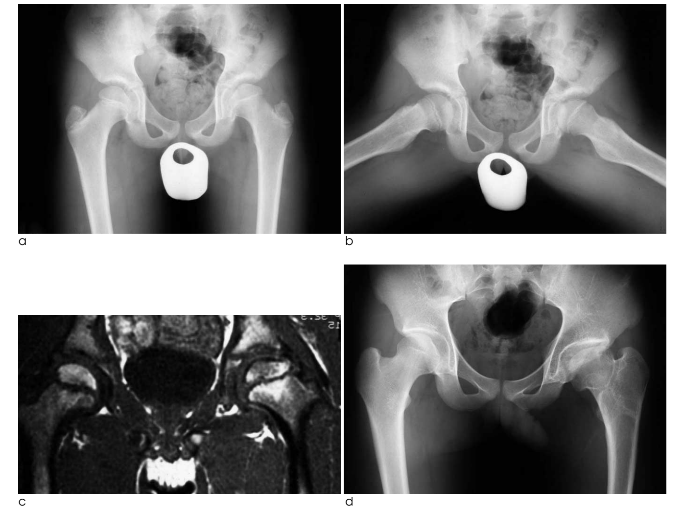
Fig. 1. Legg-Calve-Perthes disease of left femoral head in a ten-year-old boy. Initial anteroposterior (C) and lateral (b) radiographs show involvement of anterior epiphysis of left femoral head with subchondral fracture (arrows), consistent with Catterall group 2. (c) Coronal T1-weighted MR image (TR 566/TE 11) shows Catteral group 3 involvement (arrows) of left femoral head. (d) Follow-up anteroposterior radiograph 68 months after initial radiographs shows an ovoid left femoral head, short femoral neck, and trochanteric overgrowth, consistent with Stulberg class 3.

Prognosis as determined by femoral head deformity was determined on follow-up radiographs obtained at least 24 months after diagnosis evaluated according to the Stulberg classification (15). The interval between the initial and follow-up radiographs was 50 months (range, 25-91 months). The three reviewers determined the Stulberg classification by consensus using the following criteria: Class 1 reveals a completely normal hip joint. In class 2, a spherical head is present. One or more of the following abnormal characteristics of the