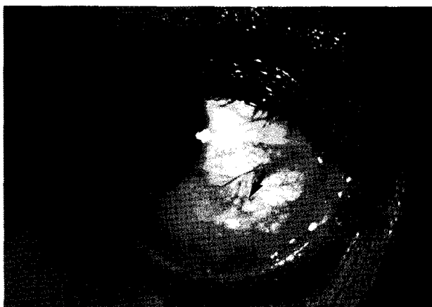
Fig. 1. A helical mass under the bulbar conjunctiva of the dirofilariasis patient.