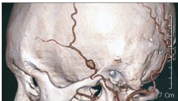
Fig. 1. Three-dimensional computed tomography angiogram of the left external carotid artery showing an aneurysm of the preauricular branch of the superficial temporal artery.