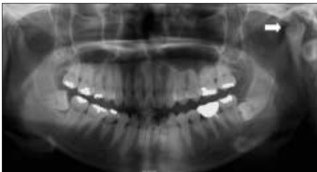
Fig. 1. Preoperative orthopantomogram showed a well-defined radiopaque mass (arrow) in the left mandibular condyle.

Chondrosarcoma is classified as central (arising within the bone) and juxtacortical (arising on the surface of the bone) or primary (develop from normal bone) and secondary (develop in preexisting lesions) 6) . However, histopathologic diagnosis is based on the grading system. Evans et al 7) classified chondrosarcoma into three degrees based on the frequency of mitosis, cellularity and nuclear dimensions. Grade I chondrosarcomas show hypercellularity, enlarged chondrocytes, hyperchromatic nuclei, binucleation and nuclear pleomorphism. Some cases show myxoid matrix and focal areas of calcification. Myxoid degeneration is a feature that suggests