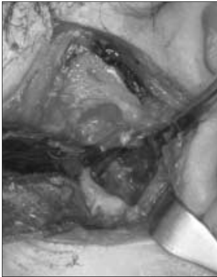
Fig. 3. Intraoperative findings. The yellowish mass was shown in the mandibular condyle.