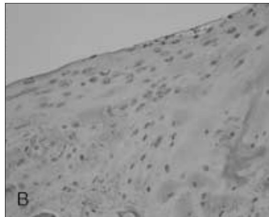
Fig. 5. Immunohistochemical examination. Tumor cells show positive vimentin (A) and S-100 protein (B).

malignancy in cartilage tumors 5 ). Characteristic binucleation was also observed in this case. Binucleation and nuclear pleomorphism is common in large sized (> 5cm) grade I chondrosarcoma. The degree of the myxoid change was higher in the larger tumors 5 ). Grade II lesions of the jaw and facial bones are more cellular and showed greater nuclear pleomorphism and binucleation than grade I tumors 5 ). Grade III chondrosarcomas showed more pronounced nuclear enlargement and multinucleation 7 ). Histologic differentiation also influences the metastatic rate, which varies from 10% for grade II cases to 71% for those in grade III. Metastasis from grade I