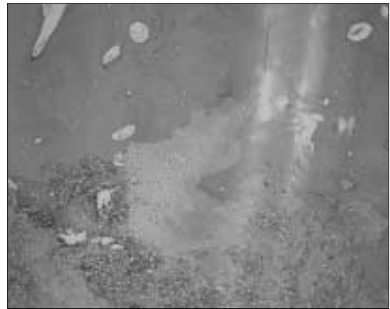
Fig. 4. Histopathologic examination. There is characteristic permeation of binucleated tumor cells into bony trabeculae.