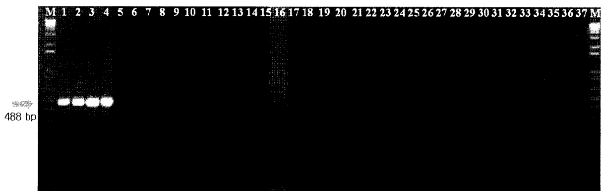
Fig. 1. PCR amplification of the partial membrane fusion protein gene from Xanthomonas oryzae pv. oryzicola using the pathovar-specific XOCMF and XOCMR primer set.

Lane M, Size marker (1 kb plus DNA ladder; Gibco BRL); lanes 1–37 are listed in Table 1.