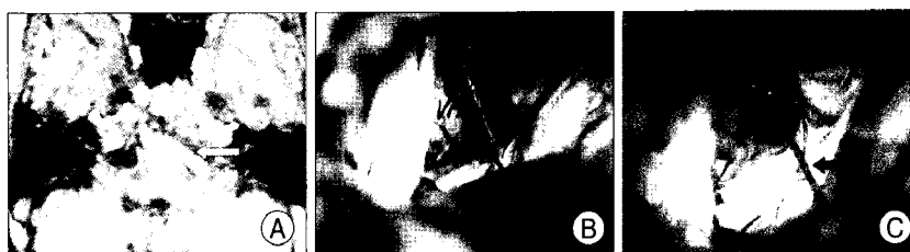
Fig. 2. Recurred case in a 66-year-old male. Short range 3D magnetic resonance angiography image shows that vertebral artery compresses the 7th nerve root exit zone (white arrow)(A). Operation view showing simultaneous compression VA with posterior inferior cerebellar artery, anterior inferior cerebellar artery (B). It could not be decompressed enough due to the presence of small perforator (black arrow)(C).

Immediately after surgery, the complete relief of HFS was observed (good) in 61 cases (77.2%). When assessed at follow up inspections 6 months after surgery, good outcome was shown in 68 cases (86.1%). In addition, significant reduction of HFS was detected in 16 cases (20.3%) of patients immediately after surgery but in 5 cases (6.3%), at 6 months after surgery. As for the failure of improvement of HFS at the time immediately after surgery, symptoms improved to certain extent in all patients as time passed but when inspected 6 months after surgery at the outpatient clinic, spasm recurred in 3 patients (Table 2). The causes of