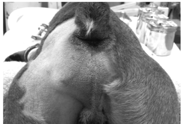
Fig 1. A left perineal swelling (Case No. 1). The swelling is located ventral to the typical level of perineal herniation.

An 8-year-old intact male mixed breed dog weighing 7.9 kg presented to the Hangang Animal Hospital for examination of a left perineal swelling that had been present for approximately a month. No tenesmus, stranguria, or any clinical signs other than the swelling was observed by the owner. On physical examination, the swelling was observed ventral to the typical level of perineal herniation (Fig 1). Digital palpation to the swelling confirmed left reducible perineal herniation. Plain radiographs revealed that no pelvic or abdominal contents other than the fat were displaced into subcutaneous perineal