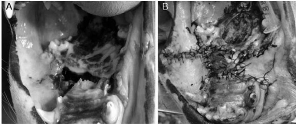
Fig 1. The patient had a 5 × 3 cm hard palatal defect centrally with communication between the oral and the nasal cavities (A). A primary surgery was performed using buccal mucosal flaps and a free graft flap of hard palate mucoperiosteum from the tissue adjacent to the defect (B).