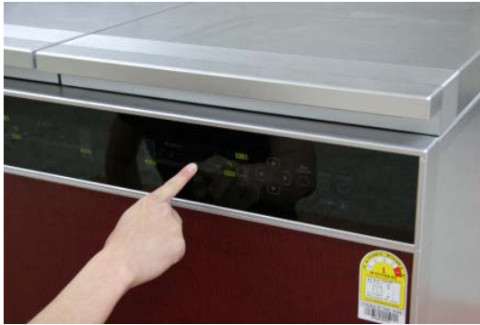
Figure 2. Crystal control panel with touch screen

is the first model that adopts the crystal panel among the products. The former models have button-type membrane switches. The control panel of the Kimchi refrigerator has arrow keys, LED displays for mode selection and for food selection (Figure 3).