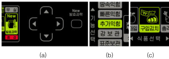
Figure 3. Control panel; (a) arrow keys, (b) mode selection keys, (c) food selection keys