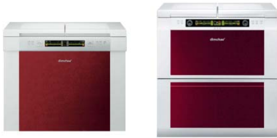
Figure 1. Typical Kimchi refrigerators

the Kimchi refrigerators. These forms are effective in keeping lower temperature in air flow, but they are likely to bring about users' bad postures.