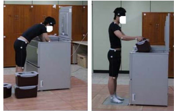
Figure 4. Tasks for physical usability test

Before beginning the experiment, an experiment conductor explained the objective of experiment briefly