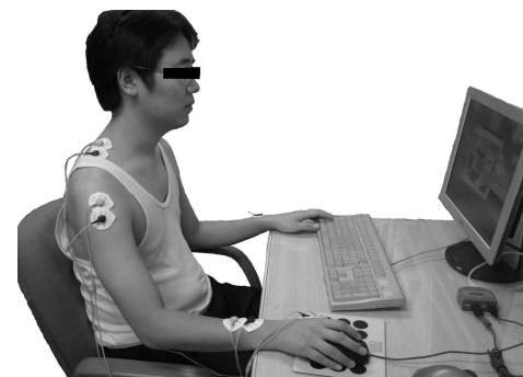
Figure 2. Electrode positions and experimental position.