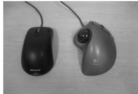
Figure 1. The computer mouse and the trackball.

We referenced previous studies (Gustafsson and Hagberg, 2003; Karlqvist et al, 1999), and selected the right four upper limb muscles, upper trapezius, middle deltoid, extensor digitorum, and first dorsal interosseous to measure the muscle activities used during computer mouse and trackball operations. We attached electrodes to the skin on the muscles referenced by Cram et al (1988). Manual muscle testing (MMT) was performed to select the center of the muscle belly, and the positions were marked. Then we polished the skin