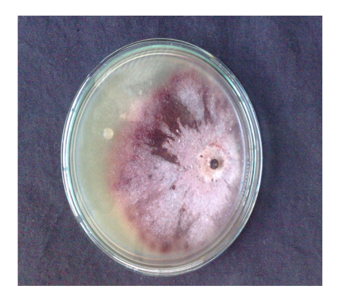
Fig. 1. Dual culture showing competition for space and nutrients between the Pythium irregulare pathogen (white restricted growth) and the Epicoccum purpurascens potential bioagent fungus (reddish wide growth) on potato dextrose agar medium after 12 days of incubation.

analysis was the presence of P-(trimethylsiloxy) cinnamic acid methyl ester (approximately 15%) in the fungal acetone extract. This compound has direct antifungal activity