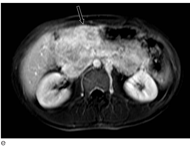
Fig. 1. A 16-year-old boy with epigastric pain for one year.(a) Ccontrast-enhanced CT of the abdomen showed a multilobulated contoured solid mass with inhomogeneous enhancement in the region of the pancreatic head (arrows).(b) The axial T2-weighted MR image obtained at the same

level as in A, depicts a multilobulated mass with heterogeneous high signal intensity.