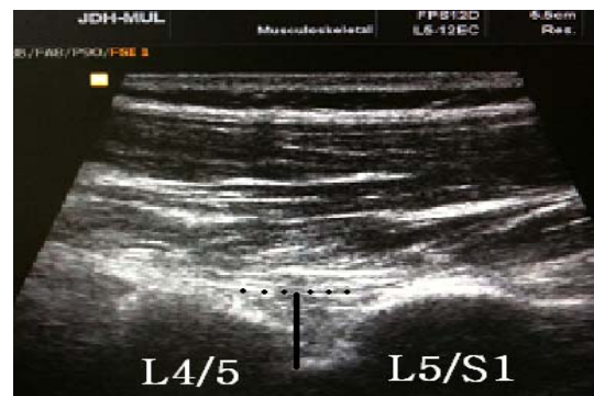
Figure 2. A thickness measure of the DM (L4/5: L4/5 zygapophyseal joint, L5/S1: L5/S1 zygapophyseal joint).

Descriptive statistics of the measurements of the DM are shown in Table 2. Interrater reliability was excellent; [ICC(3,1)=.93~.94; 95% CI (test session 1)=.78~.98, 95% CI (test session 2)=.77~.98; p<.01]. Intrarater reliability was excellent; [ICC(3,1)=.90; 95% CI (examiner 1)=.68~.97, 95% CI (examiner 2)=.67~.97; p<.01]. All ICCs and SEMs are listed in Table 3. A Bland and Altman plot for reliability is shown in Figure 3, 4.