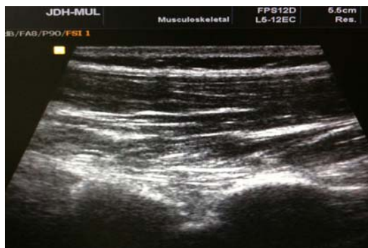
Figure 1. Image of the lumbar multifidus.

Examiner 1 removed the previously test setting and then left the room. The subject was instructed to rest for 10 minutes. Examiner 2 entered the room and repeated the same procedure for the DM measurement to finish test session 1. On the next day, test session 2 was conducted. The subjects were retested by both examiners using the same measurement protocol utilized in test session 1.