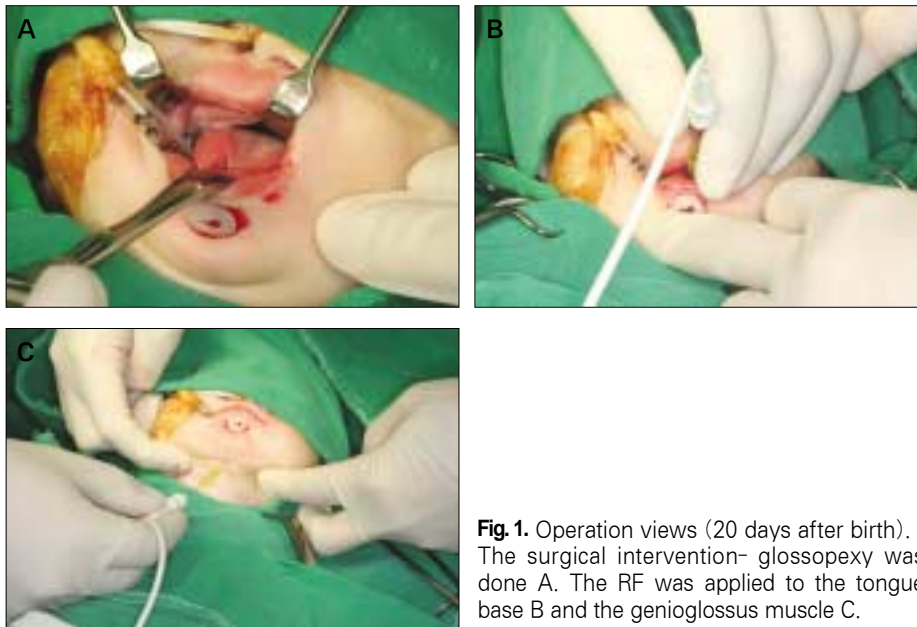
Fig. 1. Operation views (20 days after birth). The surgical intervention- glossopepy was done A. The RF was applied to the tongue base B and the genioglossus muscle C.

uration was dropped in supine position. The glossopepy was applied again (Fig. 2A). Two weeks later, the wire suture was removed and the oxygen saturation of the patient was not influenced by the patient's head position. The airway was also successfully maintained without wire fixation (Fig. 2B). Ten months after birth, the patient readmitted for the treatment of pneumonia. The airway was completely maintained at 10 months after birth (Fig. 2C). After then, the follow-up until 12 months after birth was uneventful.