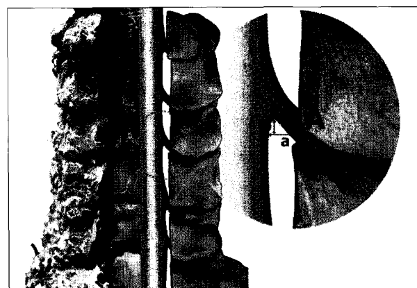
Fig. 2. Photograph schematic view showing the measured parameters after total laminectomy. A : MPF of the lateral mass after total laminectomy, a : horizontal distance from point A to the lateral surface of the dura, b : vertical distance from point A to the axilla of the nerve root, c : length of the exposed nerve root.