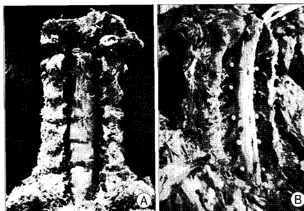
Fig. 1. Photographs showing cadaver specimens after total laminectomy (A) and after medial one-half facetectomy (B). After medial one-half facetectomy, each nerve root crossing the corresponding intervertebral disc (pink pin) is clearly visible.

The cervical lateral mass is posterior and lateral to the cervical spine (Fig. 1). Medially, it forms a margin with the lamina and laterally forms a margin with the base transverse process. The superior and inferior articular processes form a facet connecting adjacent vertebrae on the lateral side. In