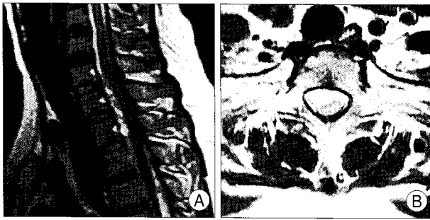
Fig. 3. Case 3. A : Preoperative sagittal T2-weighted image shows epidural hematoma at C7-T4. B : Axial T2-weighted image shows hematoma with cord displacement.

C3-C5 level. He had no past medical history and no abnormal laboratory data. MRI of the cervicothoracic spine showed an irregular dorsal and left lateral epidural mass lesion from the C3 to T3 levels with slightly high signal intensity on T1-weighted images and heterogeneous high signal intensity on T2-weighted images. There was no definite signal change in the spinal cord on MRI even though the lesion displaced the spinal cord toward the right side.