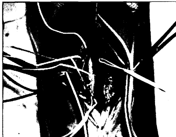
Fig. 1. Intraoperative findings after a skin incision showing the tibial nerve and its branches