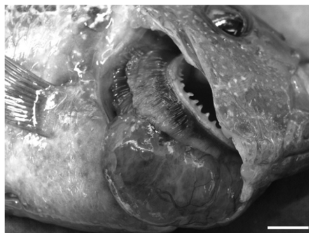
Fig 1. A fish showing a large, ovoid, semi-transparent mass located on the ventral branchial arches. Vessels had developed within the mass (bar = 1 cm).

The necropsy revealed anemia, a mass in the branchial cavity and a pale liver. The mass was intertwined among gill, skin and bone and looked as though it was liquid-filled and transparent. Vessels inside the mass were thus observed