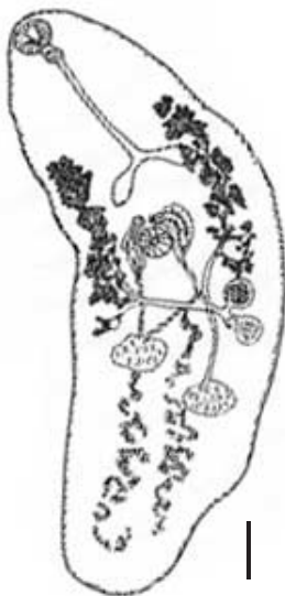
Fig. 1. Adult of Cymatocarpus solearis Braun, 1899 obtained at 576 hr from the ovotechnique culture in this study. Scale bar = 0.40 mm.

This study is the first report of metacercariae of C. solearis , a digenean of the family Brachycoeliidae, which have been successfully grown in vitro into adult worms. This parasite has been successfully grown in vitro into adult worms capable of produc-