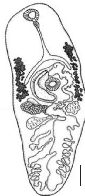
Fig. 2. Adult of Cymatocarpus solearis Braun, 1899 obtained from a marine loggerhead turtle, Caretta caretta (L.), by Manter (1910) in Florida, USA. Scale bar = 0.40 mm.