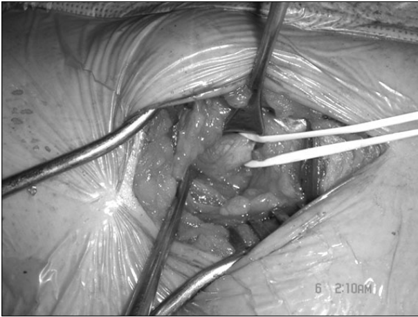
Fig. 1. Exposure of the axillary artery.

nula from approximately 2 to 3 cm lateral to the main skin incision to prohibit kinking of the cannula (Fig. 1, 2). The surgeon should check whether the guided wire for the arterial cannula was positioned in a true lumen by intraoperative transesophageal echocardiography during this procedure.