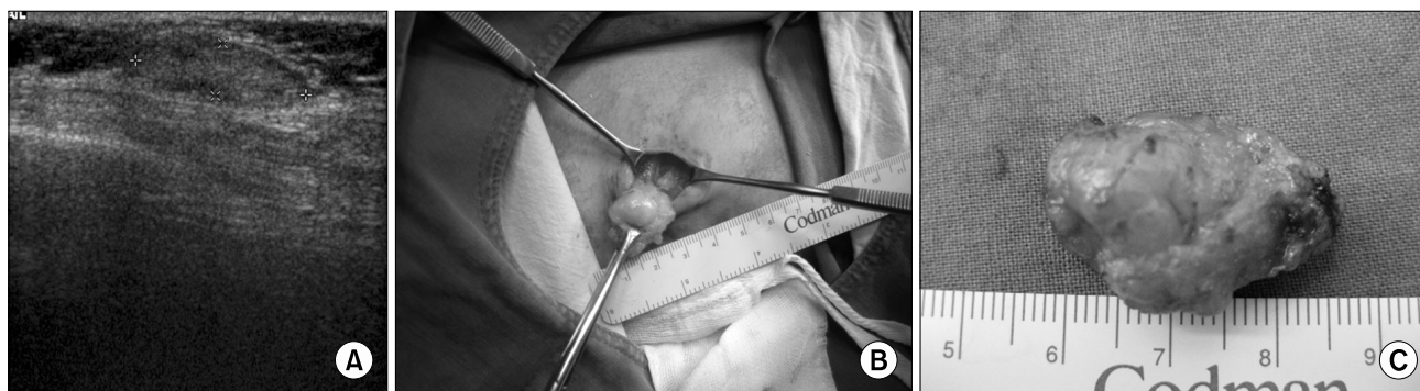
Fig. 1. (A) Chest wall sonographic finding showing a 2.0-cm chest wall mass. (B) Photograph of operative findings. (C) Specimen showing a 2.0-cm chest wall mass.