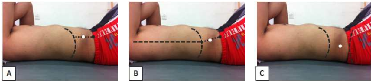
Figure 1. Three different probe locations. A: probe location 1 (PL1)–below the rib cage in direct vertical alignment with the anterior superior iliac spine (ASIS), B: probe location 2 (PL2)–halfway between the ASIS and the ribcage along the mid-axillary line, C: probe location 3 (PL3)–halfway between the iliac crest and the inferior angle of the rib cage and then adjusted to ensure the medial edge of the TrA.

subjects. Thus, right lateral abdominal muscles were captured by US. The probe location was marked by a marker pen so that the identical probe location was used in the test session (Ferreira et al, 2004). Images of each TrA, IO, and EO were acquired three times, and the mean value was used for data analysis (Costa et al, 2009). Examiners were randomly selected to control the order effect (Springer et al, 2006; Teyhen et al, 2011). After the first examiner finished the measurement, the subjects rested for 5 minutes to minimize fatigue. For consistency across subjects, images were collected directly at the end of inspiration at rest, as determined by visual inspection of the abdominal content (Springer et al, 2006). A total of 18 images were assessed for each subject, and a total of 360 images were analyzed.