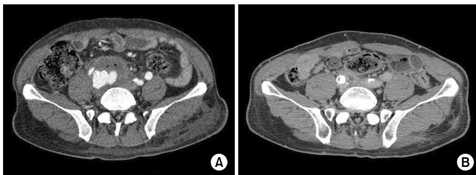
Fig. 1. (A) Preoperative CT scan, mycotic aneurysm was enclosed by abscess. (B) Postoperative CT scan shows the resolved mycotic aneurysm and abscess.