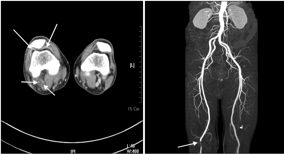
Fig. 1. CT angiography shows that a multi-loculated cystic mass nearly obstructing the popliteal artery and cysts in the synovial area (arrows).