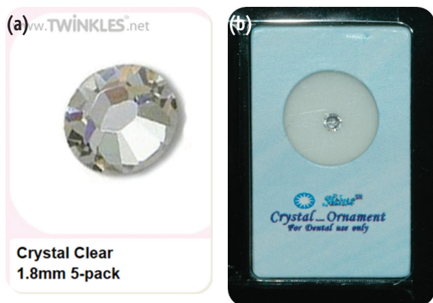
Figure 1. Materials used. (a) Twinkles: Clear, ø1.8 mm; (b) Shine: A style, ø1.8 mm.