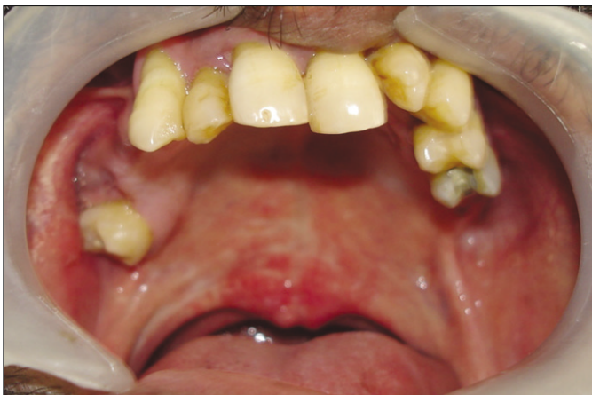
Fig. 1. Pretreatment intraoral view showing low draped soft palate with bifid uvula.

Initially, an edentulous interim palatal plate with palatal lift extension (Fig. 2A) was fabricated using heat cure acrylic resin (DPI Heat Cure, DPI, Mumbai, India) and was given to the patient for a period of one month. This was done with the purpose of getting the patient accustomed to the feel of the prosthesis and the pressure exerted by the palatal extensions. After one month bite registration was done using bite registration paste (Reposil, Dentsply, Milford, USA) and a new interim acrylic palatal lift prosthesis replacing the missing teeth along with lower complete denture (Figs. 2B and 2C) having balanced occlusal scheme was given to the patient for another