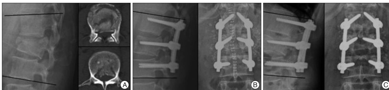
Fig. 2. A 42-year-old male fell backwards from height of 3 meters. He was diagnosed with burst fracture of L2 and underwent total laminectomy with posterior short segment screw fixation involving the index level. Instrumentations were supplemented with posterolateral fusion. A : The preoperative lateral view and CT scan show 10.1° kyphotic angle and 62% canal encroachment, respectively. B : The immediate postoperative lateral view shows 12.3° lordotic angle and AP view reveals that bone graft materials were placed in the transverse process of fixed segments. C : At a 1-year follow-up, the lateral view shows 6.2° lordotic angle and the AP view demonstrates that bone grafts were partially absorbed (progression of bone fusion).